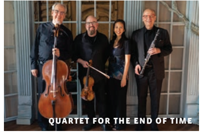
QUARTET FOR THE END OF TIME