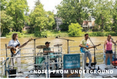
NOTES FROM UNDERGROUND