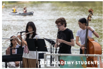
JAZZ ACADEMY STUDENTS