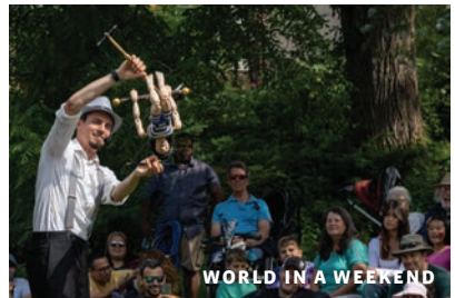
WORLD IN A WEEKEND