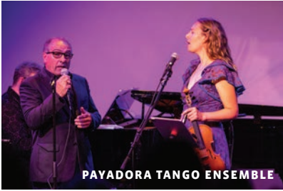
PAYADORA TANGO ENSEMBLE