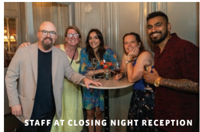
STAFF AT CLOSING NIGHT RECEPTION