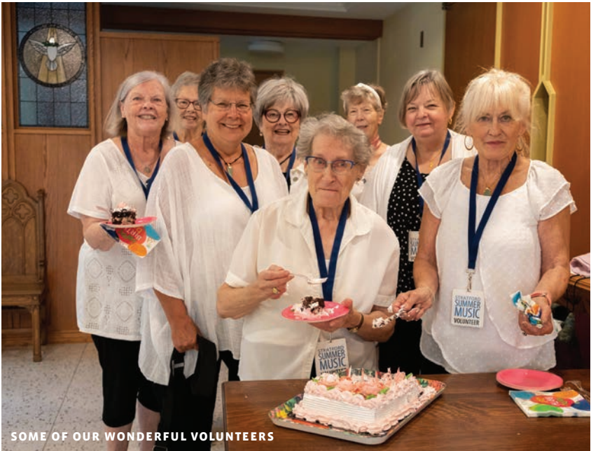
SOME OF OUR WONDERFUL VOLUNTEERS