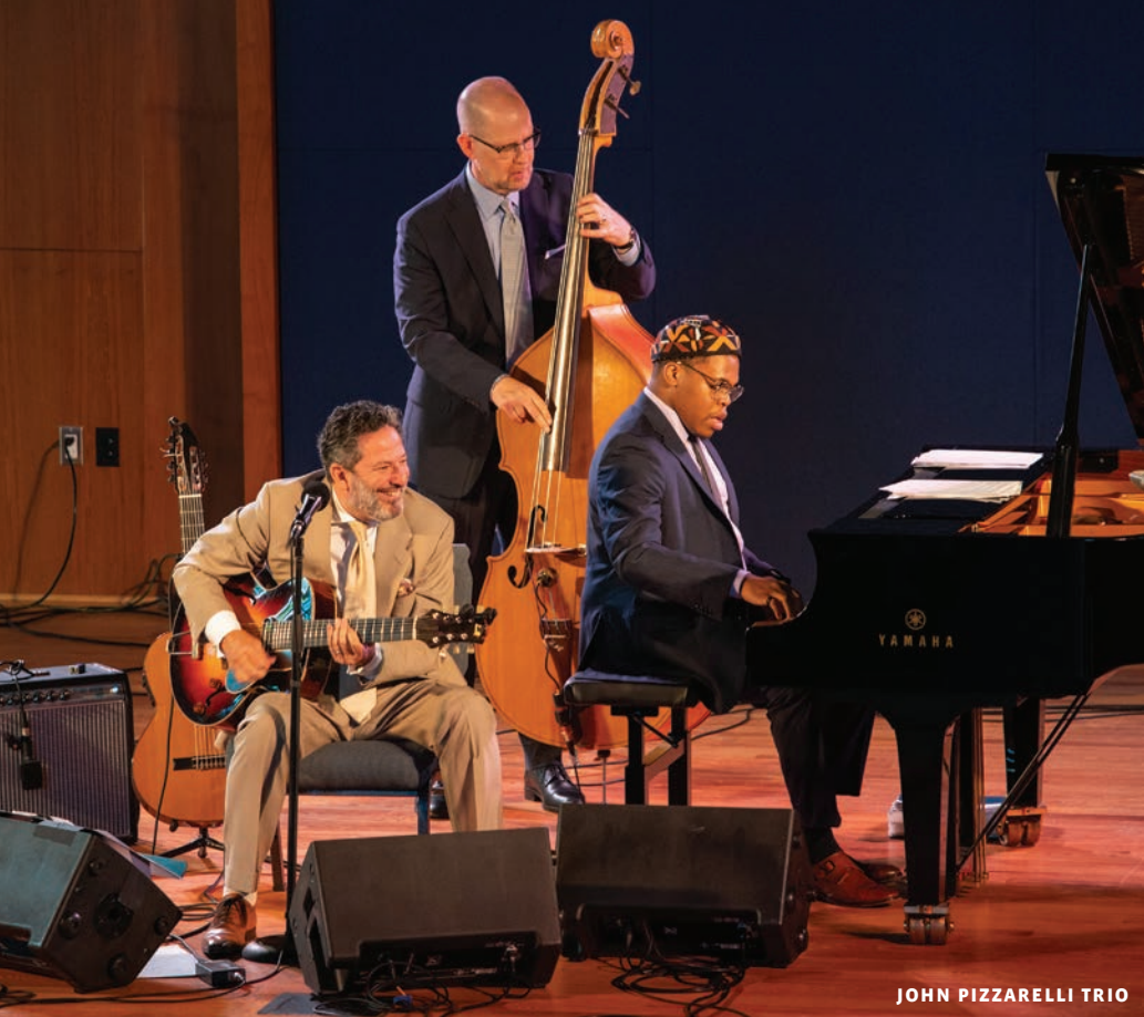
JOHN PIZZARELLI TRIO