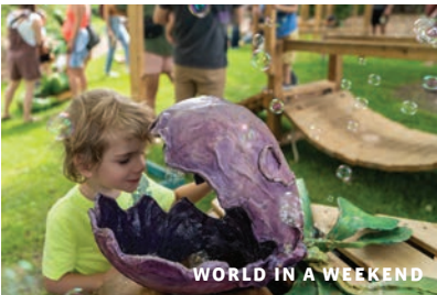
WORLD IN A WEEKEND