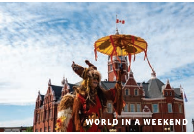
WORLD IN A WEEKEND