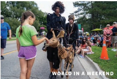
WORLD IN A WEEKEND