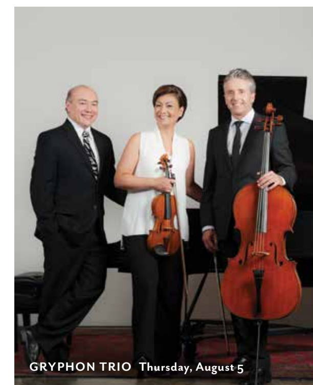
GRYPHON TRIO Thursday, August 5

TOM PATTERSON ISLAND Lakeside Drive, near the bottom of Queen Street