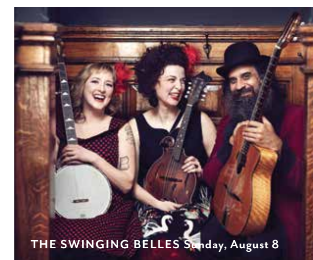
THE SWINGING BELLES Sunday, August 8