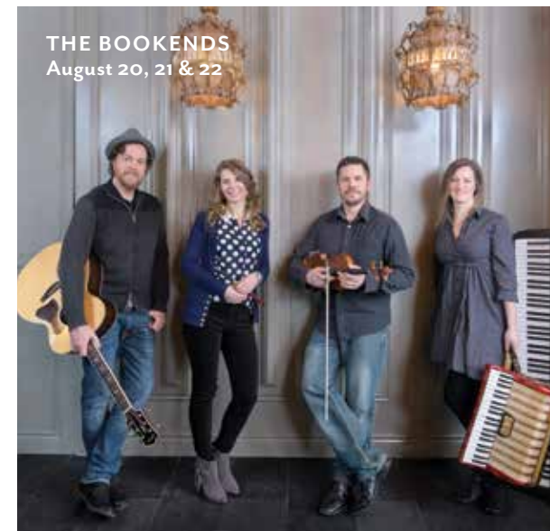
THE BOOKENDS August 20, 21 & 22